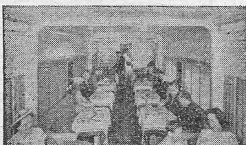
Mealtime on the Texas Eagle means delicious food, courteously and skillfully served in a setting of tasteful beauty.