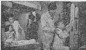
Spacious and luxurious Texas Eagle bedrooms provide the ideal accommodation for families or business groups.