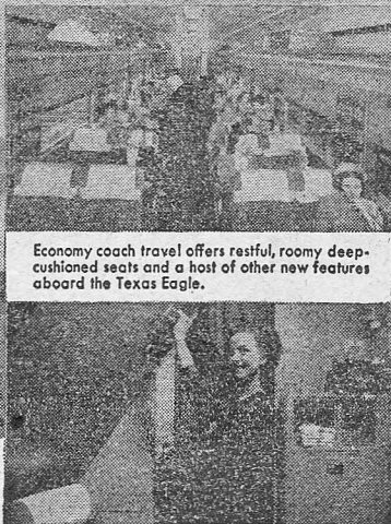
Economy coach travel offers restful, roomy deep-cushioned seats and a host of other new features aboard the Texas Eagle.